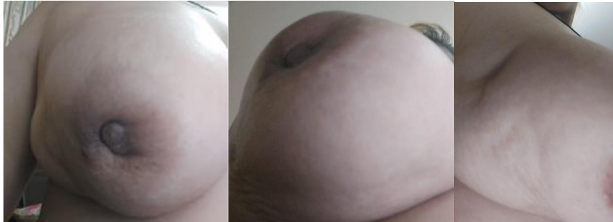
Figure # 1. Photo of the left breast with deformation of the contours of the gland, with an inverted nipple and the presence of a tumor conglomerate in the axillary region.

Status Localis. The left mammary gland is edematous. Skin with signs of lemon peel. The nipple is retracted. In the left upper and lower-outer quadrants, a tumor is palpable up to 6.0 cm in diameter, dense, painful to the touch. In the axillary region on the right, a large conglomerate of lymph nodes up to 6.0 cm in diameter is palpable.