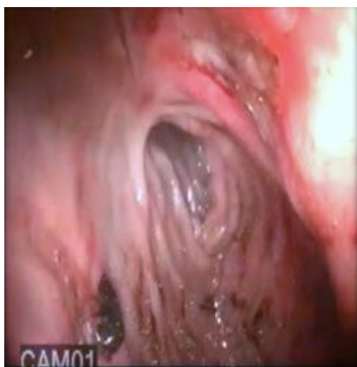
Fig. 1. Acute ulcers of the body of the stomach (the ulcer of the posterior wall is covered with a

The standard in the diagnosis of erosive and ulcerative lesions of the upper gastrointestinal tract is endoscopy. Usually, acute ulcers of small sizes 5–10 mm in diameter, the shape of the ulcers is round, the edges are smooth, the bottom is not deep, often with a hemorrhagic plaque (Fig. 1, 2). Their multiplicity is characteristic of acute ulcers, a combination of their localization in the stomach and in the duodenum is often observed.