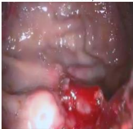
Fig. 2. Acute ulcer of large curvature of the stomach with signs of bleeding (F-I-B)

During an endoscopic examination, in addition to examining the gastroduodenal zone, a primary assessment of the intensity and nature of the bleeding is of particular importance. In order to achieve hemostasis, we used thermal (monopolar, bipolar electrocoagulation, hydrocoagulation, argon plasma coagulation), injection and mechanical (vessel clipping) hemostasis methods. The choice of hemostasis method depended on the intensity of ulcerative bleeding. With bleeding F-II-B and F-II-C, conservative therapy was performed in 155 (72.1%) patients. In 21 cases (9.7%), the edges of the ulcer were chipped, electrocoagulation was performed in 7 (3.3%), argon plasma coagulation in 12 (5.6%), and clipping in 9 (4.2%). In 11 (5.1%) cases, combined methods of endoscopic stopping of bleeding were used (Diagram. No. 1).