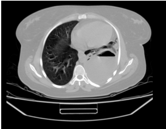
Fig.2. Acute purulent lung abscess

history, only 9 (32.1%) patients from this subgroup were under mechanical ventilation during treatment in the covid centre. The anamnestic period of the development of the disease included the period of the patient's stay outside a specialized hospital with the continuation of treatment in a therapeutic clinic or on an outpatient basis. In patients II Subgroups of bilateral lung lesions were noted in only 4.6% of cases.