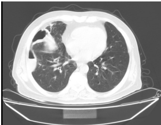
Fig.3. Gangrenous lung abscess

Local complications of acute purulent-destructive lung diseases, according to the medical history, were pleural empyema, pyopneumothorax, exudative pleurisy, purulent endobronchitis and hemoptysis. In some cases, these complications occurred in a combined form. On average, there were 1.51 complications per patient.